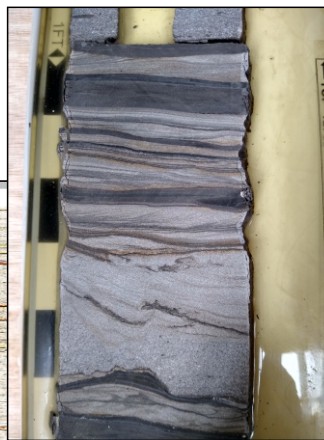
Integration of the core material with open access subsurface data where possible.