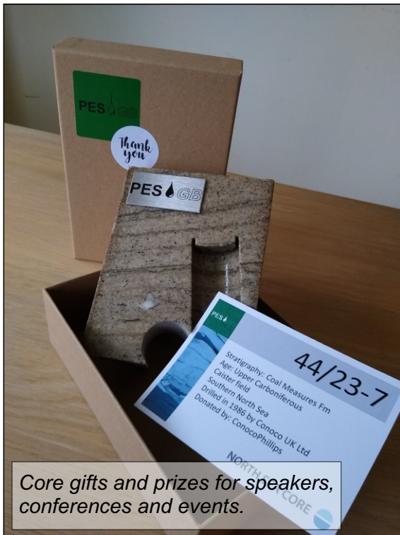
Core gifts and prizes for speakers, conferences and events.